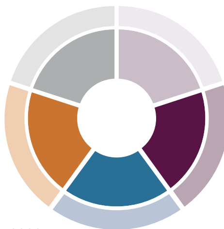
Current model portfolio positioning as of 31st of March 2022