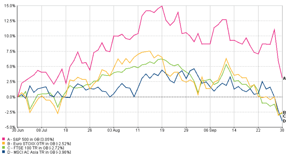
Pricing Spread: Bid-Bid • Data Frequency: Daily • Currency: Pounds Sterling

30/06/2022 - 30/09/2022 Data from FE fundinfo 2022